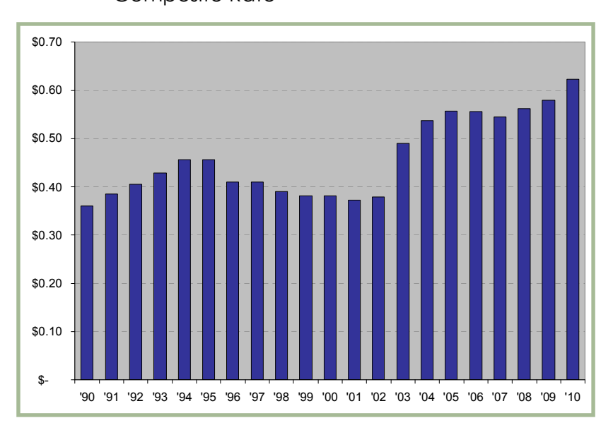
Chart 1: Workers' Compensation Composite Rate

Three reforms will provide immediate cost savings in the workers' compensation system without reducing injured workers' benefits. They will improve patient care, without detriment to patient satisfaction or access to qualified health care providers. These cost-effective reforms that could bring Washington into the competitive mainstream cannot be ignored or postponed.